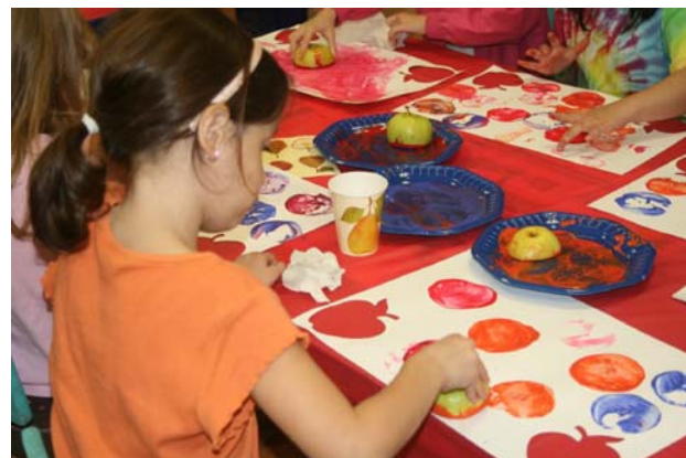
The Children's Department hosted a fall printmaking craft.