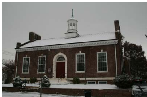
Winter at Bound Brook Library