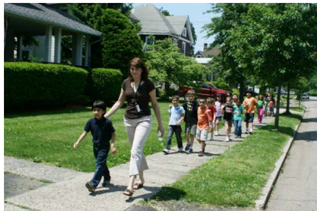
A first grade class walks to the library

Even though our summer reading theme is all about bugs, we'll take a trip into "The Strange World of Reptiles" with our SNAKES 'N' SCALES program on Friday, July 18 at 2:00 pm (Ages 5+). At this program you will meet crocodiles, turtles, lizards, and snakes! Reptile behaviors, adaptations, individual animal personality and where these animals are appropriate pets will also be discussed.