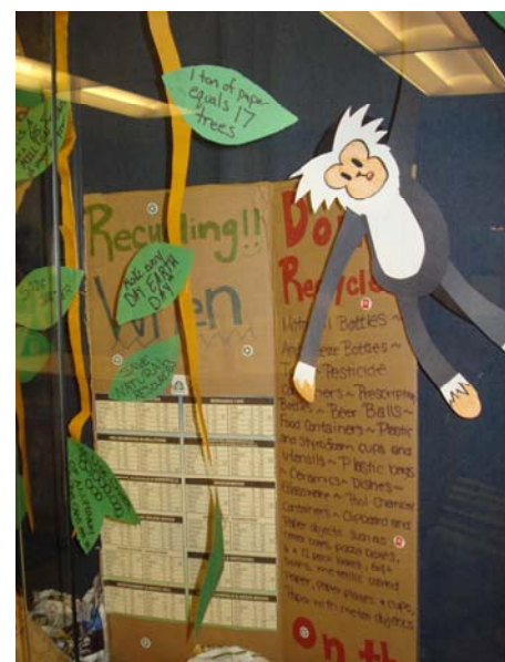
The Bound Brook High School Environmental Club Earth Day display at the library in April