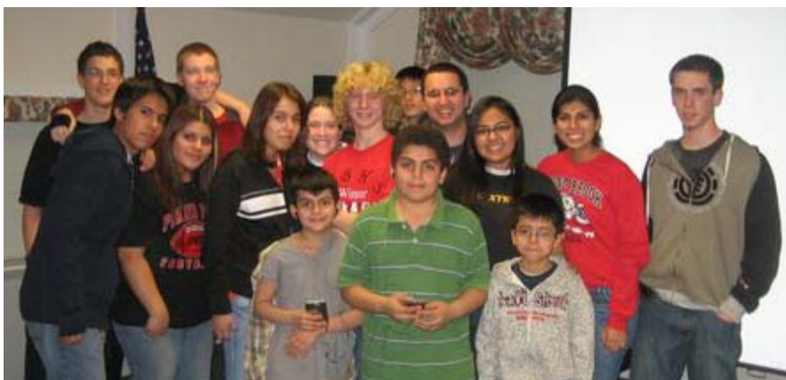
Members of the Bound Brook High School Robotics Club at the library