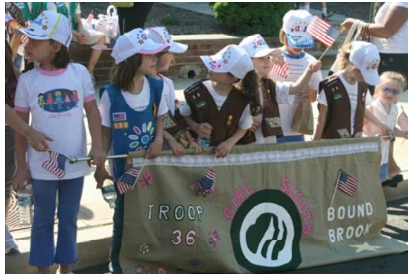
Bound Brook Little Leaguers and Brownies prepare to march in the Memorial Day Parade