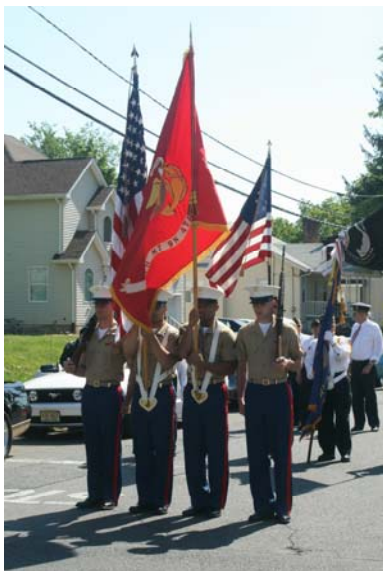
A Marine Color Guard lead the parade from the Library to the Vosseller Avenue Monument

Memorial Day traditionally denotes the beginning of the summer season. Have you ever wondered why "Memorial" is part of our Library's name? In 1924, the newly constructed library building was dedicated as a memorial to Bound Brook citizens who served in World War I. Their names are listed on a large monument set at the corner of High Street and Hamilton Street. This Memorial Day, Bound Brook's annual parade stepped off at this intersection. The Friends of the Library sponsored a pre-parade reception for the marching units, which included Brownies and Girl Scouts, the Little League, the Junior High/High School Band, uniformed firefighters and rescue squad members, and the Mayor and Council.