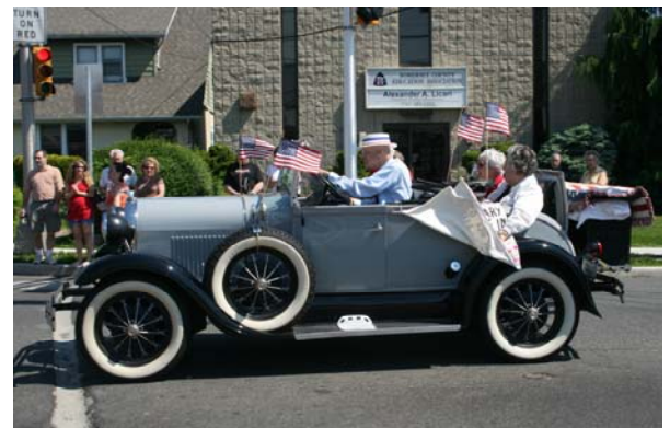
Members of the Women's Literary Club, the Library's founding organization, ride in this classic car